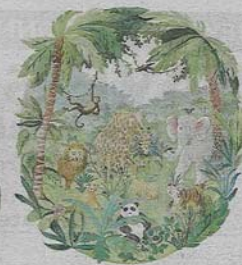
The $368 Jungle Boogie wall panel adds instant interest to a child's bedroom. For stockists call Verve Fabrics 9532 2003. For more designs from Wallpower for Kids digital wall art, go to eiffinger.com