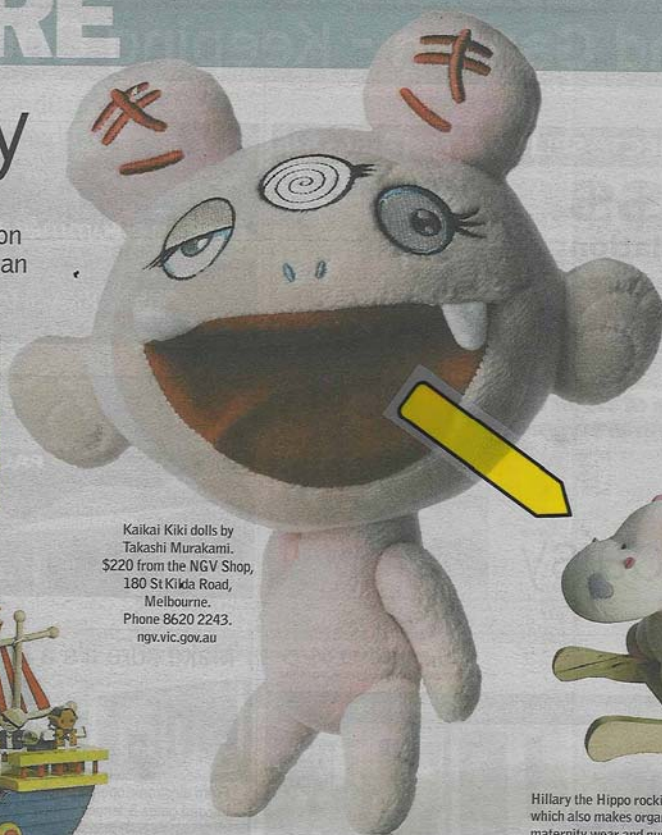
Kaikai Kiki dolls by Takashi Murakami. $220 from the NGV Shop, 180 St Kilda Road, Melbourne. Phone 8620 2243. ngv.vic.gov.au