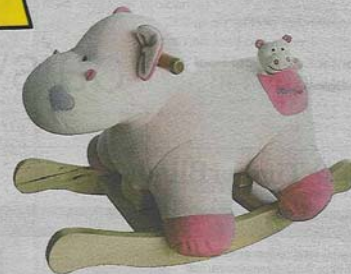
Hillary the Hippo rocking horse, $159.95 from Bay Bee Cino, which also makes organic cotton baby clothes, toys, cots, carriers, maternity wear and nursing garments ($10 from the sale of each garment goes to the National Breast Cancer Foundation). Knits for babies are made by women in Zimbabwe. Phone 1300 229 233 for nearest stockist. baybeecino.com.au